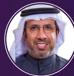
Board Member - GDA